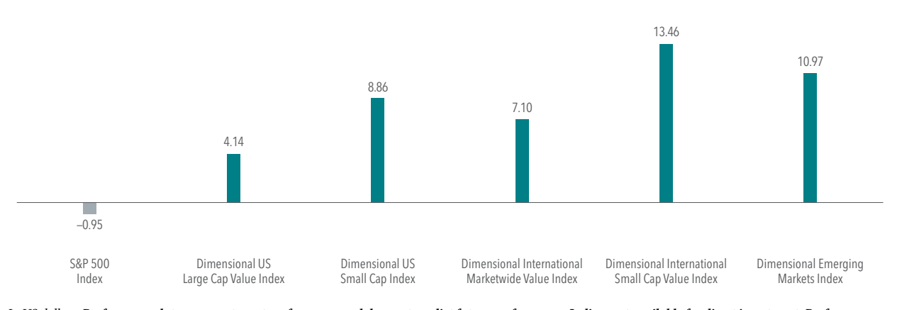
In US dollars. Performance data represents past performance and does not predict future performance. Indices not available for direct investment. Performance does not reflect the expenses associated with the management of an actual portfolio. S&P data © 2019 S&P Dow Jones Indices LLC, a division of S&P Global. See Index Descriptions in the appendix for descriptions of the Dimensional index data.

Annualized returns (%): January 2000–December 2009